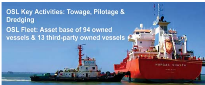
OSL Key Activities: Towage, Pilotage & Dredging OSL Fleet: Asset base of 94 owned vessels & 13 third-party owned vessels

Key activities carried by the company include towage, pilotage, and dredging. With an